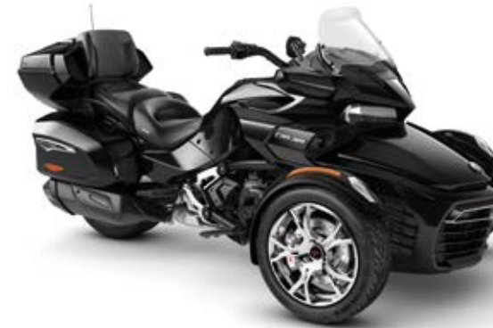
STEEL BLACK METALLIC* CHROME EDITION * Parts and trims available in Chrome or Dark Editions