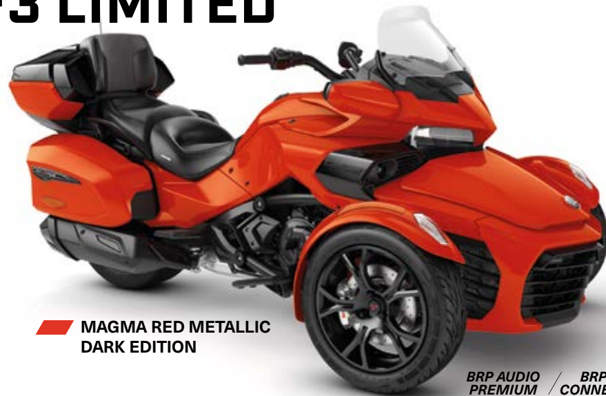
MAGMA RED METALLIC DARK EDITION