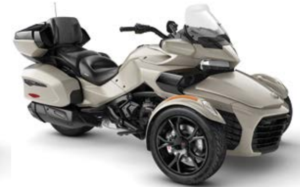
LIQUID TITANIUM DARK EDITION