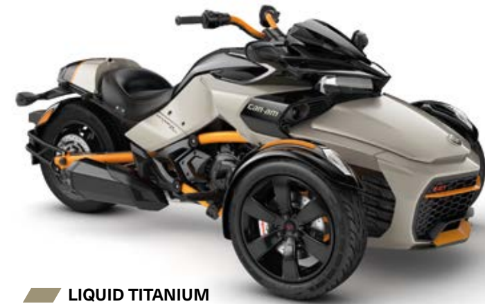
LIQUID TITANIUM SPECIAL SERIES