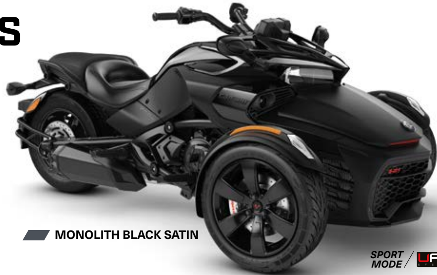
MONOLITH BLACK SATIN