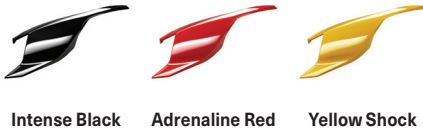
Intense Black Adrenaline Red Yellow Shock