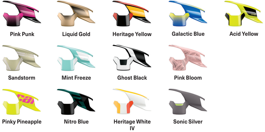
Pink Punk Liquid Gold Heritage Yellow Galactic Blue Acid Yellow Sandstorm Mint Freeze Ghost Black Pink Bloom Pinky Pineapple Nitro Blue Heritage White IV Sonic Silver