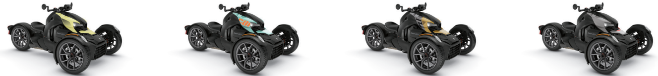
Lemon Twist Icepop Blue Gold Rush Silver Lava